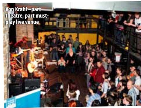
Von Krahl - part theatre, part must-play live venue