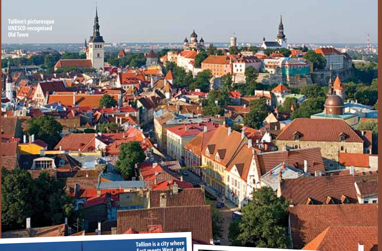
Tallinn's picturesque UNESCO-recognised Old Town

exclusively to a particular genre. The music scene revolves around events, bands, movers and shakers rather than venues dedicated to particular styles. Don't be surprised if the place hosting a lovely folk concert on Thursday follows it on Friday with a disco dedicated to rare grooves. There are mainstream nightclubs if you want to check out the Estonian pop and rock scene. Whatever your tastes, there's always something going on. And if you're looking for the ultimate Estonian folk, roots and world music Mecca, then head to Viljandi, 160km south of Tallinn.