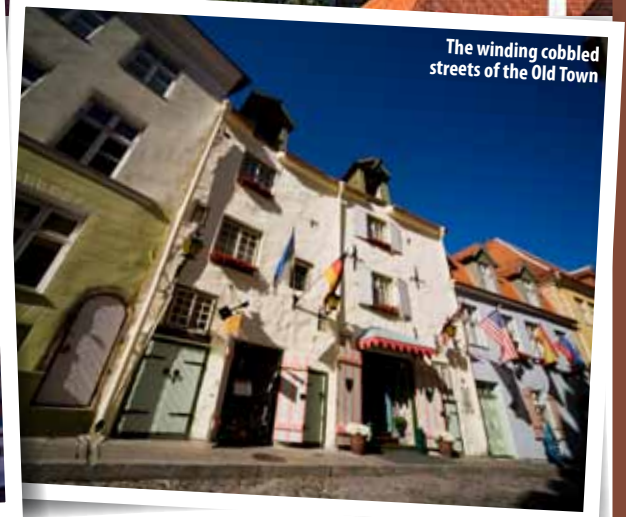
The winding cobbled streets of the Old Town