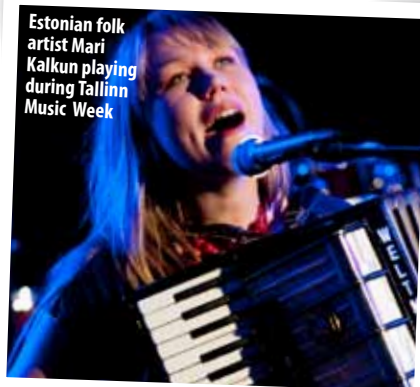
Estonian folk artist Mari Kalkun playing during Tallinn Music Week

When it comes to one big festival for all kinds of Estonian music, then this is without a doubt Tallinn Music Week, with its club nights dedicated to almost every genre of music. A showcase festival