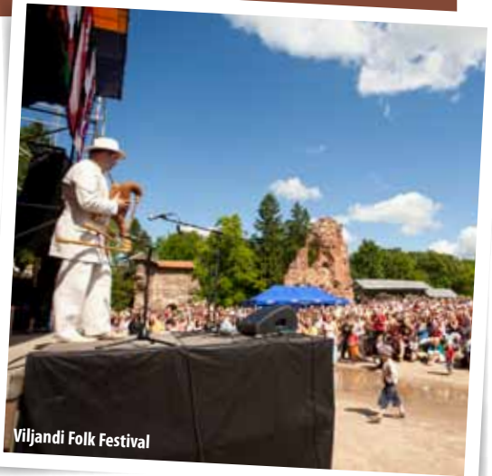
Viljandi Folk Festival

Tasuja pst 6, 71011 Viljandi, +372 434 2050, www.folk.ee/en/Traditional-Music-Center