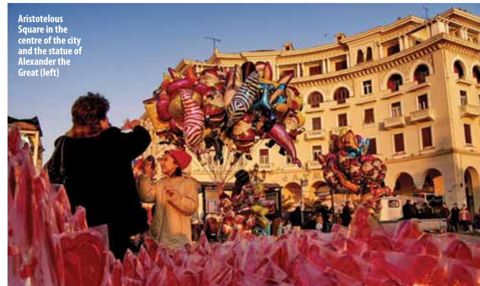
Aristotelous Square in the centre of the city and the statue of Alexander the Great (left)

Thessaloniki has just started jubilee celebrations, marking 100 years since the end of the Ottoman rule in 1912. This year the city also plays host to WOMEX, the world music expo and extensive redevelopment of the waterfront is underway.